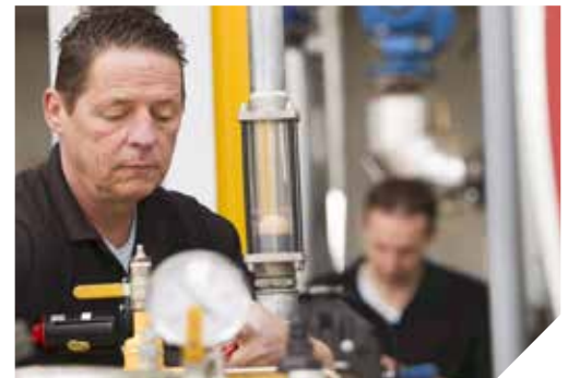
Dedicated service engineers