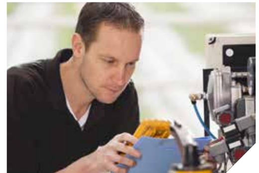
Quick Response and Best Known Methods